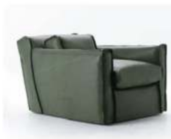
armchair Rio Bassa 76x112 h.61 leather: Evergreen Souple (C) – Plume Vert (A)