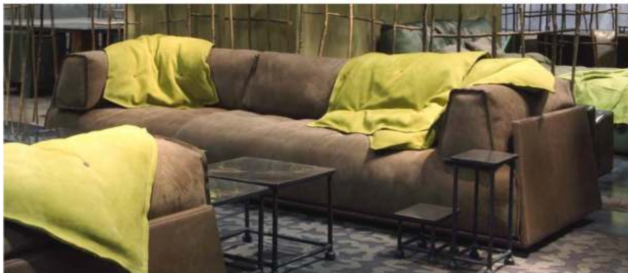
sofa Hard&Soft 320x120 h.69 leather: structure Tuscany Pianosa (A), seat Nabuck Lava (A)