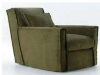
armchair Rio Alta 76x112 h.75 leather: Evergreen Souple (C) – Velvet Musk (A) – Nabuck Bottle (A)