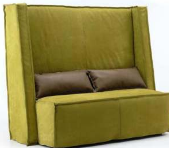
couple of lumbar supports Trieste leather: Plume Forest (A)