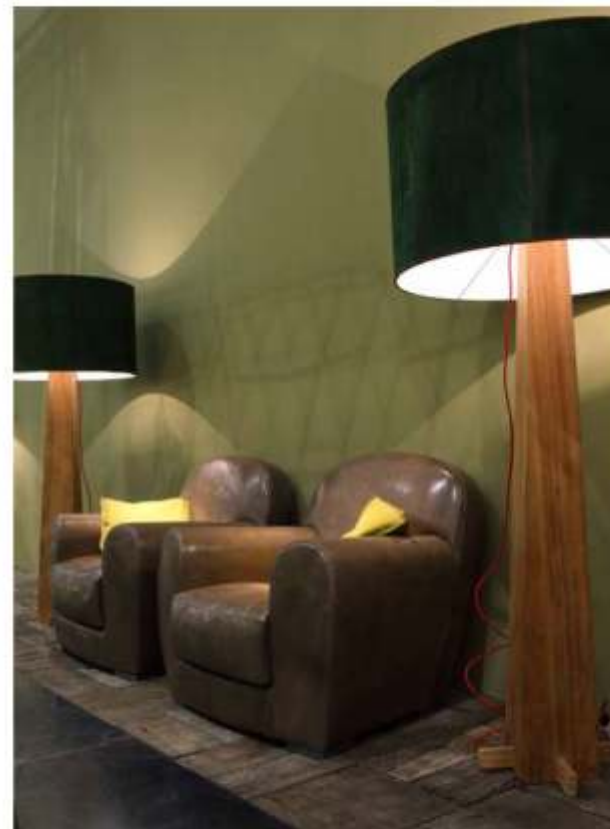
armchair Amburgo 97x97 h.90 leather: Tuscany Pianosa (A)