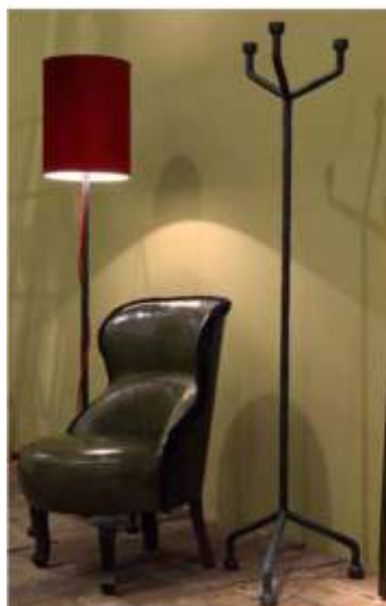
armchair Sellerina 55x64 h.83 leather: Tuscany Fiesole (A), blue posament