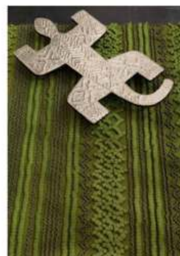
small table Lizard 40x71 h.6