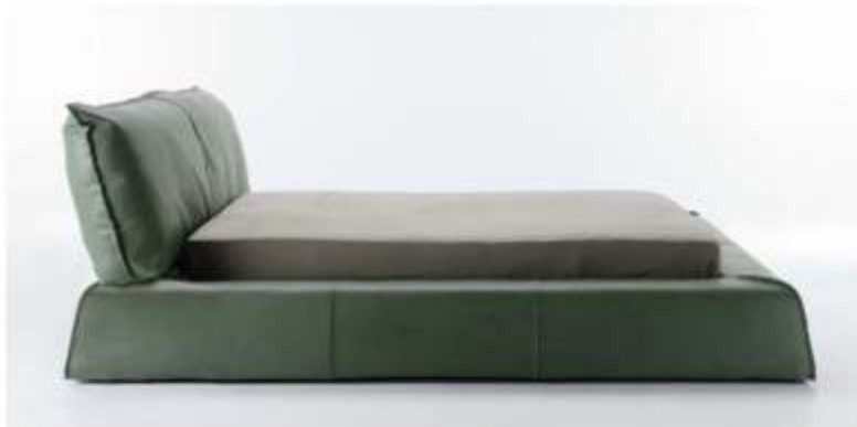
bed Paris 230x255 h.92 – spring base 160x200 leather: Plume Vert (A)