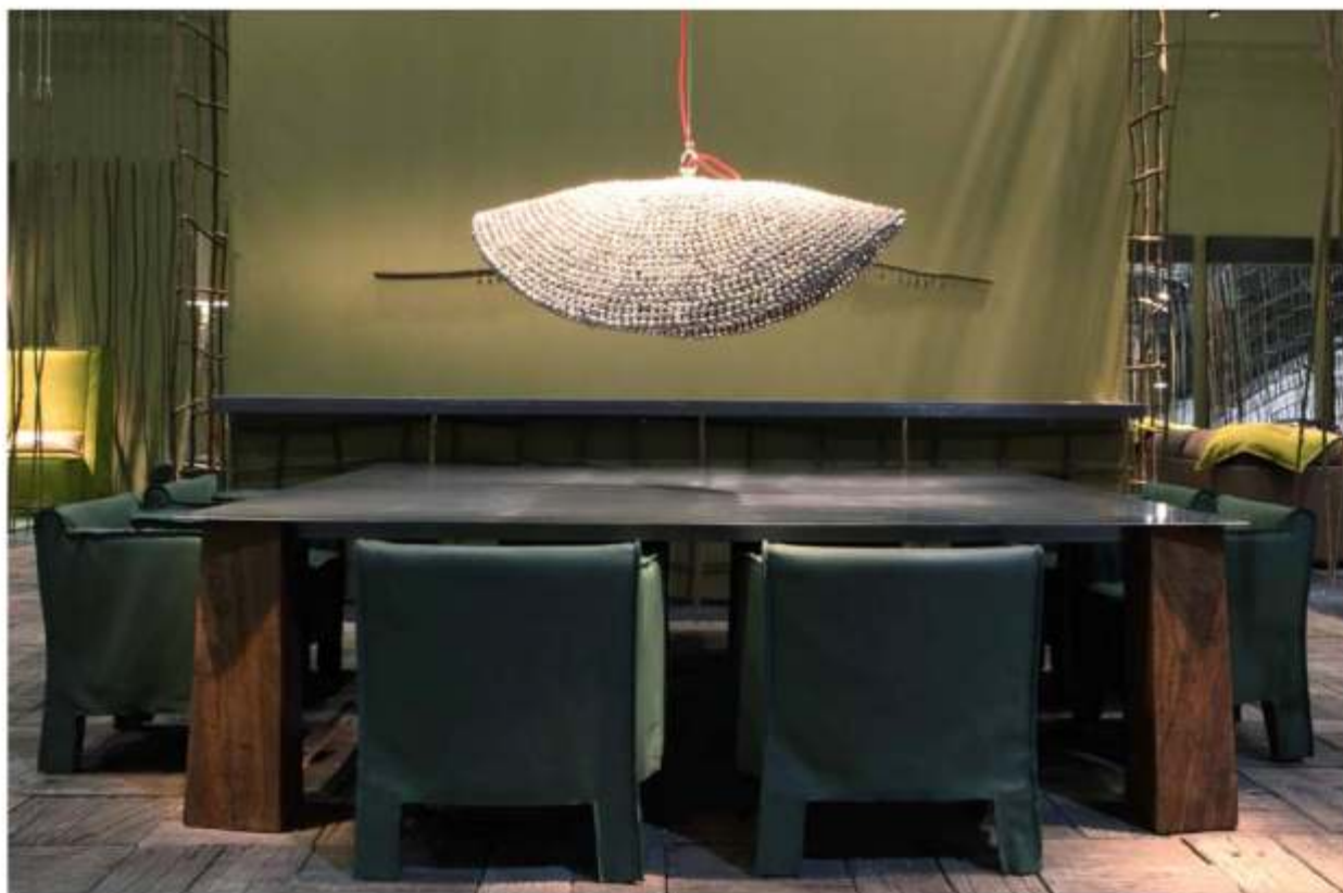
table Benao 250x250 h.73