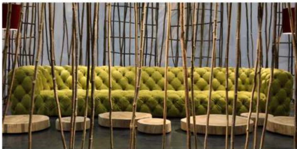
sofa Chester Moon 395x107 h.67 leather: Nabuck Green (A)