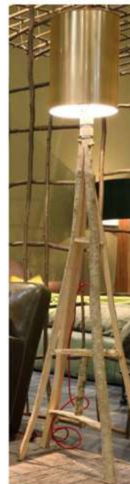
three feet lamp gold lampshade