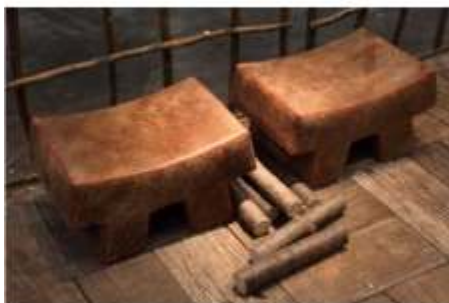
pouf Punto 50x30 h.25 leather: Mali (B)