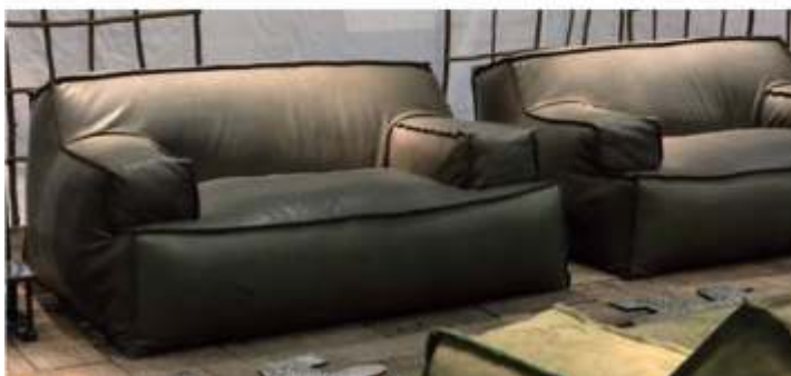
love seat Damasco 150x107 h.70 leather: Evergreen Souple (C)