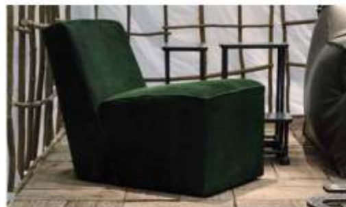
pouf Vienna Baby 45x80 h.60 leather: Velvet Bottle (A) – Evergreen Velouté (C)