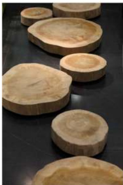
small table Natural Slice