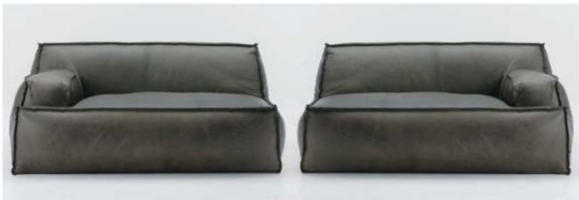
sofa Damasco 300x107 h.70 leather: Evergreen Velouté (C)