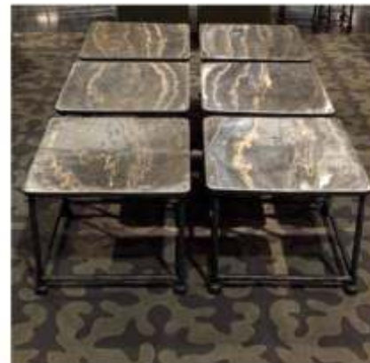
small table Mumbai* 50x50 h.40