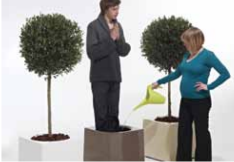
Green on wheels

Alea offers the perfect solution to the problem of moving big flowerpots. Alea consists of a frame on wheels hidden by a glass fibre cover. If you want to move the plant, you just lift the flowerpot cover 20 cm and turn it 45°. Now that the wheels are released, you can easily move the unit. When the unit is in the desired spot, just carry out the same operations in reverse order to prevent the unit from moving.