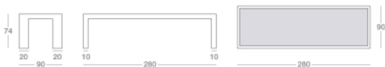
TABLE MORFEO 280X90 H74

Rectangular frame in unfinished tubular metal, thickness 3 mm. Visible weld and smoothing, with antirust protection with clear matte enamel and wax finish. Top in fir wood covered with leather.