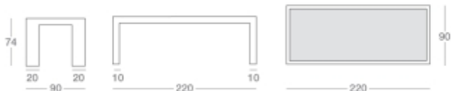
TABLE MORFEO 220X90 H74

Rectangular frame in unfinished tubular metal, thickness 3 mm. Visible weld and smoothing, with antirust protection with clear matte enamel and wax finish. Top in fir wood covered with leather.