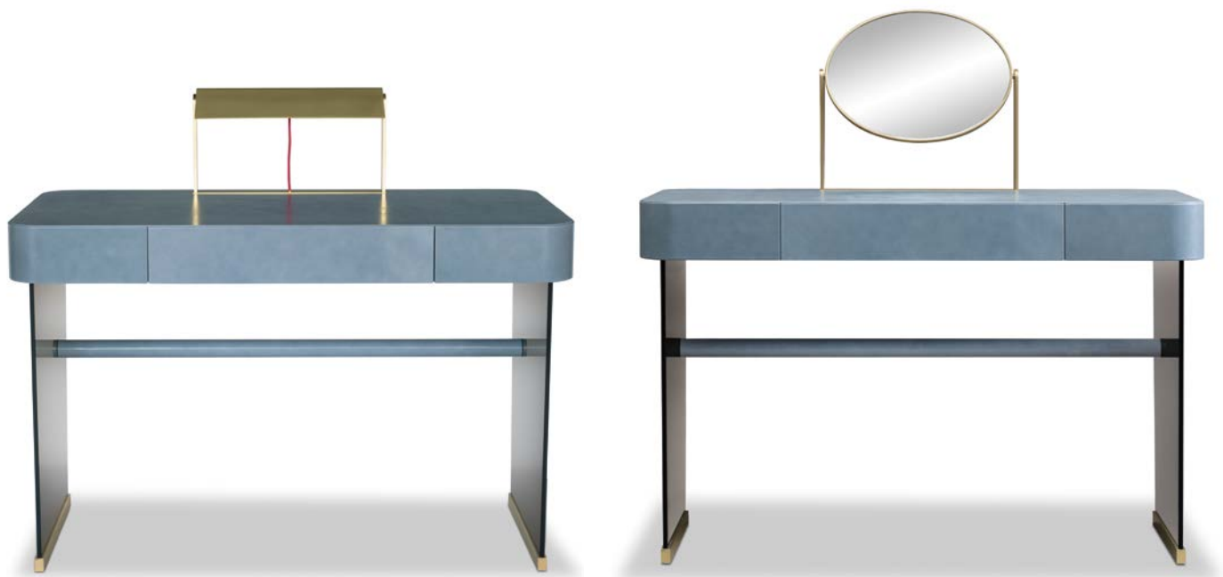
Tuscany Punta Ala

Base in vetro temperato colorato bronzo in pasta, spessore 10 mm, con profili terminali in ottone satinato. Barra di collegamento in alluminio, diametro 40 mm, rivestita in pelle e completa di borchie terminali in ottone satinato. Struttura in MDF con rivestimento in pelle con cassetto impiallacciato in palissandro India.